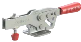
2017-U Flanged Base U-Bar