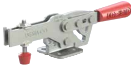
2017-U Flanged Base U-Bar