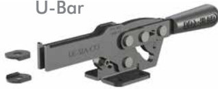
2017-U-LS-BLK ⓘ Blackout Series Flanged Base U-Bar